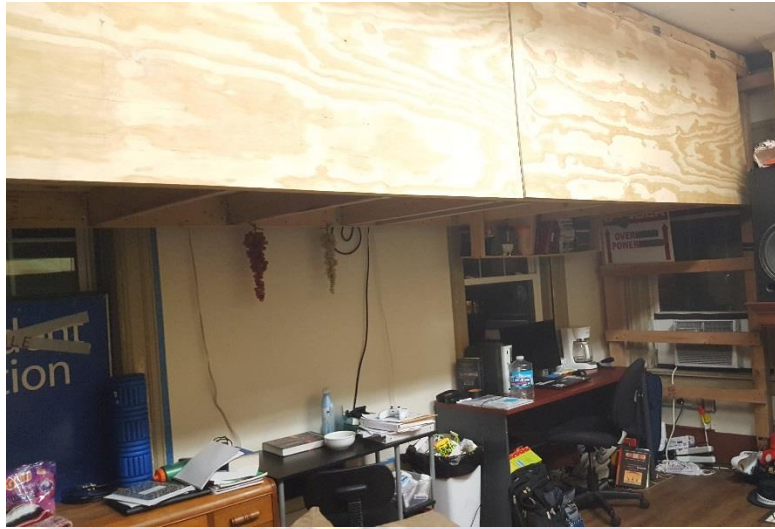
New Lofts in Rat's Nest