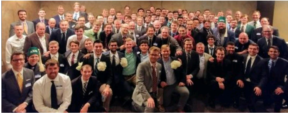
Just a good looking group of guys, rocking the HC Banquet