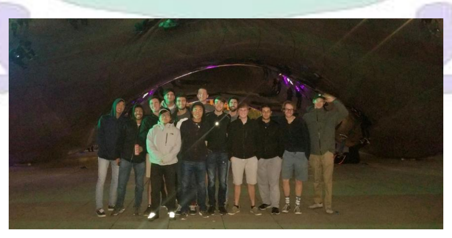
Brothers and Rushees in Chicago for MRT

This year, Rush was a great success. With freshman enrollment being 15% below what the Rose-Hulman had expected, fraternities also saw a decrease in turn-out during events. Our Rush team handled this very well, focusing on a more personal Rush. This allowed for our events to be successful and organized. Below are some images of Stud Night and Mystery Road Trip.